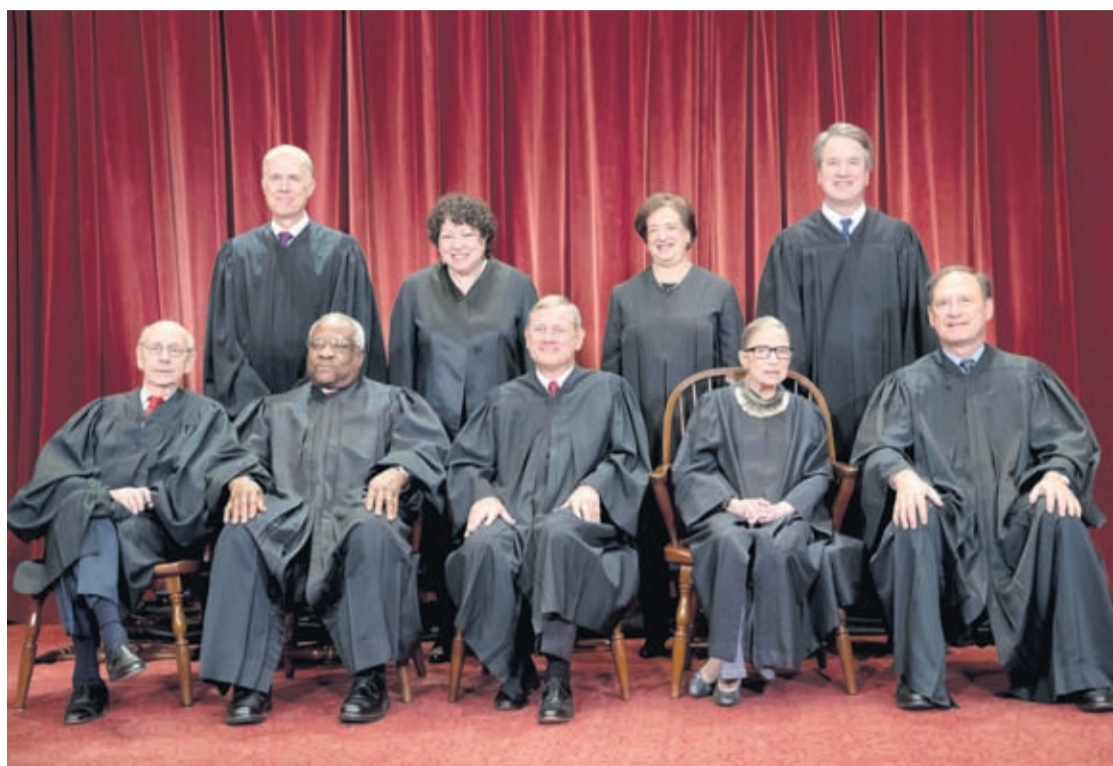
In this Nov. 30, 2018, file photo, the justices of the U.S. Supreme Court gather for a formal group portrait to include a new Associate Justice, top row, far right, at the Supreme Court Building in Washington. Seated from left: Associate Justice Stephen Breyer, Associate Justice Clarence Thomas, Chief Justice of the United States John G. Roberts, Associate Justice Ruth Bader Ginsburg and Associate Justice Samuel Alito Jr. Standing behind from left: Associate Justice Neil Gorsuch, Associate Justice Sonia Sotomayor, Associate Justice Elena Kagan and Associate Justice Brett M. Kavanaugh.

In 2017, the Trump administration announced it would broaden an exemption to the contraceptive coverage requirement that previously applied to houses of worship, such as churches, synagogues and mosques. But the change was blocked by courts. The Supreme Court's four liberal justices suggested they were troubled by the changes, which the government has estimated would cause about 70,000 women, and at most